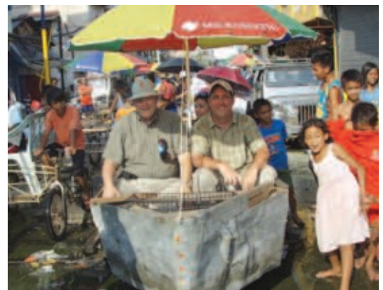
Entering the flooded Pasig neighborhoods in Manila.