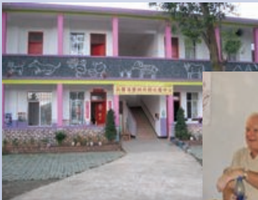
The JCBCCC is now home to 48 children. Before the end 2009 we will have completed a new dining hall and kitchen.