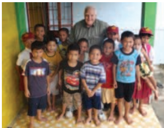
The Yokhebed Children's Home near Gunung Sitoli.