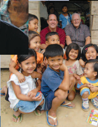
The feeding stations are changing the lives of malnourished children on Nias.