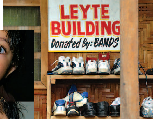
We visited our Leyte orphans in Butuan, Mindanao in June. We will be building a similar orphanage in Cebu.