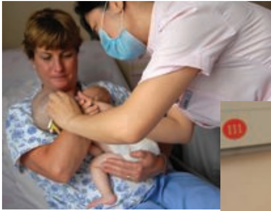
American and Chinese caregivers worked well together.