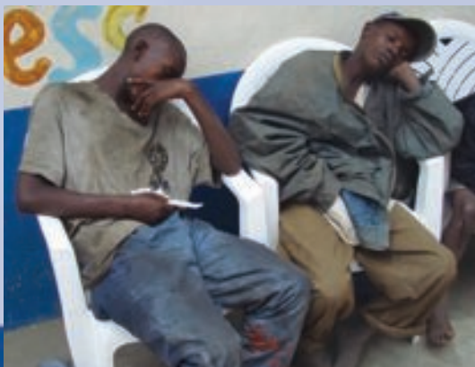
Young men ministered to by Made In The Streets .

These are the poorest of the poor and are being ministered to in an effective way by MITS .