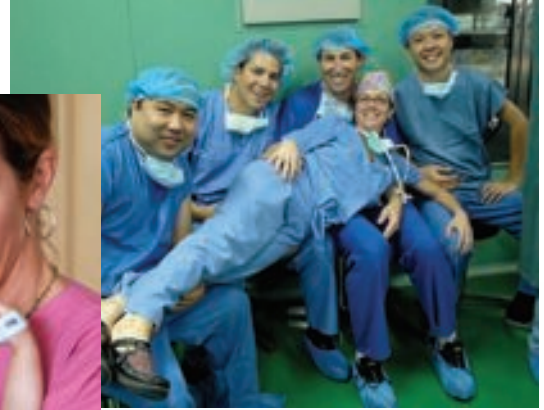
The surgical team posed for this picture during a break in a very busy schedule.